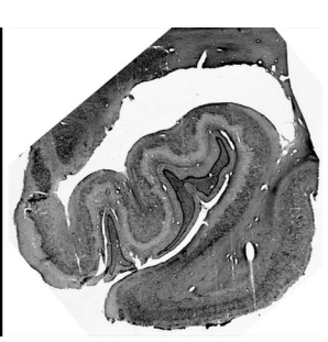
Fig. 1. Comparison of coronal sections through the medial temporal lobe in vivo ( Left ), ex vivo ( Center ), and histological images. ( Left ) Standard 1-mm in vivo image of a temporal lobe. ( Center ) A 100- \mu m isotropic ex vivo MRI image showing laminar structure in the cortex and the hippocampus. ( Right ) Nissl stain revealing distribution of cell bodies into layers. Neda Bernasconi and Jean Augustinack (Harvard Medical School, Boston, MA) provided these images.

histological image on the right, again showing that MRI has the potential to probe laminar architecture. The additional SNR required to obtain Fig. 1 Center relative to Left is approximately a factor of 1,000 or the ratio of the volume of the voxels in each image. This resolution is achievable in imaging ex vivo samples because of a number of factors that result in a dramatic increase in SNR, including scan times that would be prohibitively long in vivo (e.g., >12 h), the placement of small coils in close proximity to the sample with no intervening skull, and the absence of artifacts and image blurring due to respiratory and cardiac cycles. None of these factors are applicable in vivo, implying that the SNR needed to attain the image resolution to visualize these details in vivo must be obtained elsewhere.